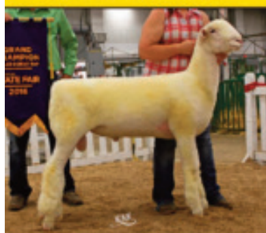
Champion Ram, 1st Late Spring Ram Lamb • Indiana State Fair