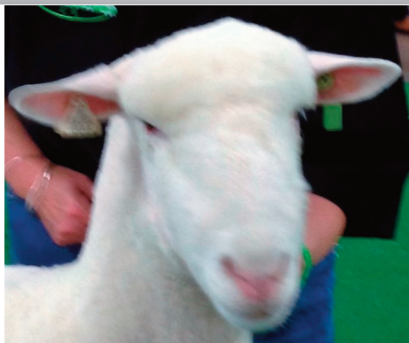
Best Headed Polled Dorset Ewe Yearling Ewe ShowGirlz Sheep Co., Paris, IL