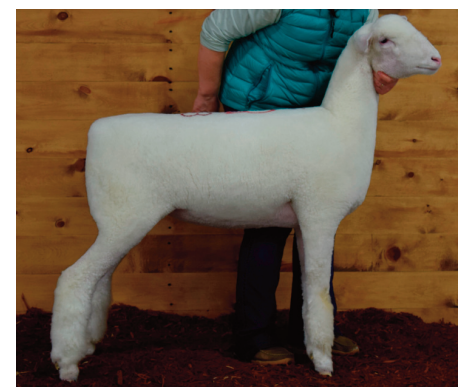
Junior Champion Polled Ewe Early Fall Ewe Lamb Lauden Acres, Dalmatia, PA