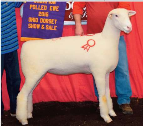
Grand & Senior Champion Polled Ewe Fall Yearling Ewe Twin Oaks Dorsets, Belle Center, OH