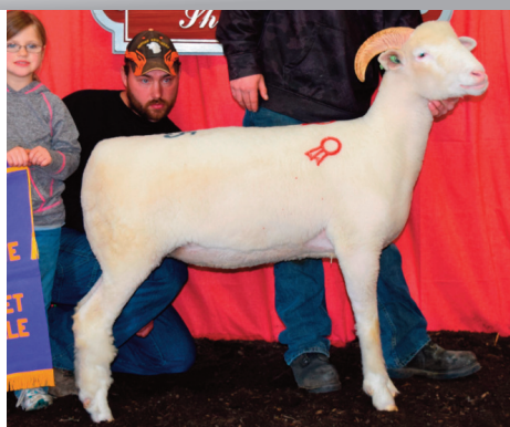
Res. Grand & Senior Champion Horned Ewe Spring Yearling Ewe ALAM Livestock, Bluffton, OH