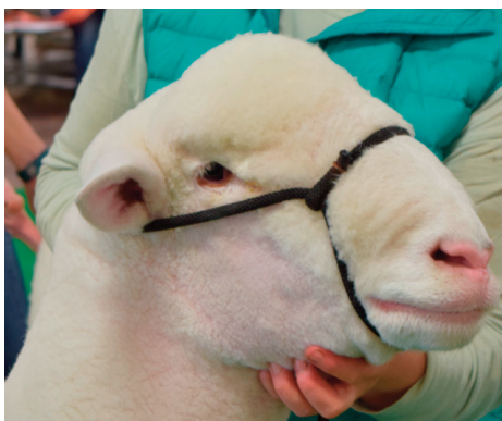
Best Headed Polled Ram Fall Yearling Ram - Grand Champion Ram Lauden Acres, Dalmatia, PA