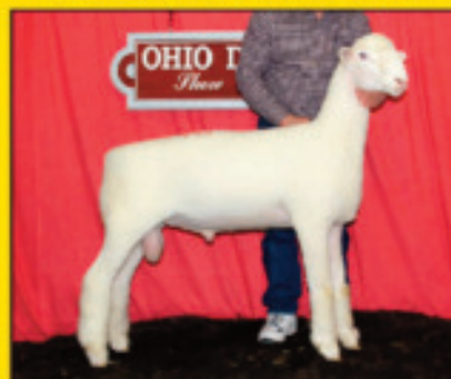
Jr. Champion Ram, 1st Early Fall Ram Lamb • 2016 Ohio Dorset Sale Sold to Valley View Farm, PA