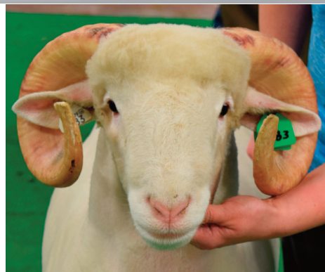
Best Headed Horned Dorset Ram Early Fall Ram Lamb - Grand Champion Ram Kendrick Dorsets, Vermont, IL