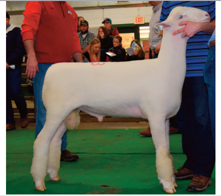
Reserve Junior Champion Polled Ram Early Fall Ram Lamb Twin Oaks Dorsets, Belle Center, OH