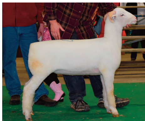
Junior Champion Horned Ewe Late Fall Ewe Lamb Cassell Horned Dorsets, Wytheville, VA