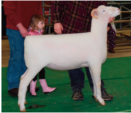
Grand & Senior Champion Horned Ewe Fall Yearling Ewe Cassell Horned Dorsets, Wytheville, VA