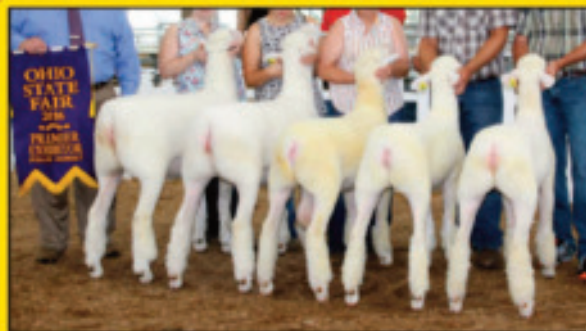
Premier Exhibitor & 1st Flock