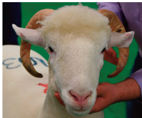
Best Headed Horned Ewe Yearling Ewe - Grand Champion Ewe ALAM Livestock, Bluffton, OH