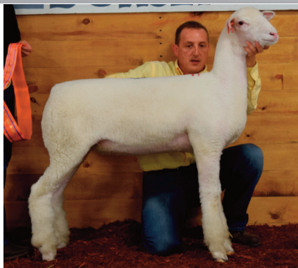
Reserve Junior Champion Polled Ewe Early Fall Ewe Lamb Quarter Mile Farm, Metamora, IL