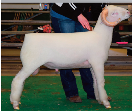
Res. Grand & Res. Jr. Champion Horned Ram Late Fall Ram Lamb Gadsby Farms, Minerva, OH

-Early Fall Ewe Lambs (28 head avg. $937.50):