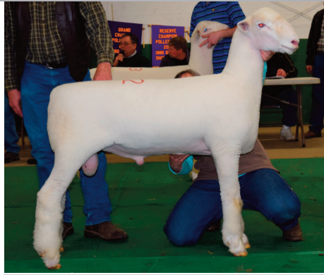
Junior Champion Polled Ram Early Fall Ram Lamb Narrow Lanes Dorsets, Dalmatia, PA