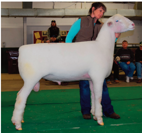
Grand & Senior Champion Polled Ram Fall Yearling Ram Lauden Acres, Dalmatia, PA