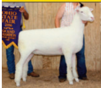
Champion Ewe, 1st Yearling Ewe Ohio & Indiana State Fairs