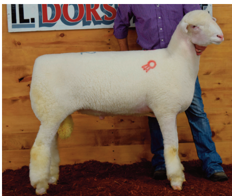
Res. Grand & Res. Sr. Champion Polled Ram Spring Yearling Ram Purple Ribbon Farm, Arcola, IL