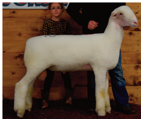
Reserve Junior Champion Polled Ram Late Fall Ram Lamb Crouch Dorsets, Maroa, IL