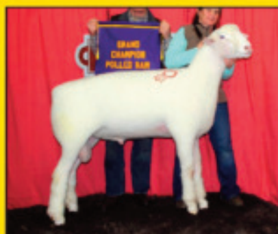
Grand Champion, Sr. Champion & 1st Fall Yearling Ram 2016 Ohio Dorset Sale Sold to Ewe'll Wonder Farm, NY