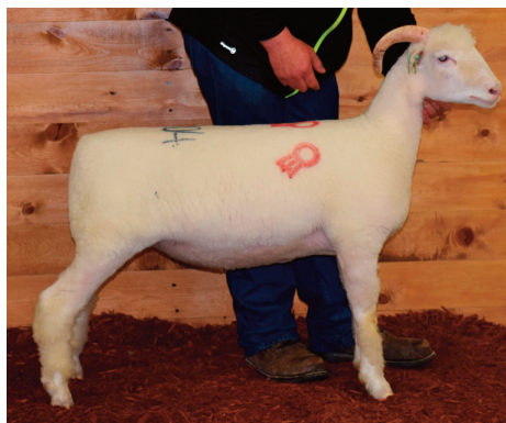
Reserve Grand Champion Horned Ewe Early Fall Ewe Lamb ALAM Livestock, Bluffton, OH

3 Total Head Grossed $1,400.00 Averaging $466.00