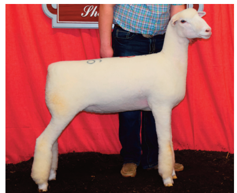
Reserve Junior Champion Polled Ewe Early Fall Ewe Lamb Crome Dorsets, Marshall, IL