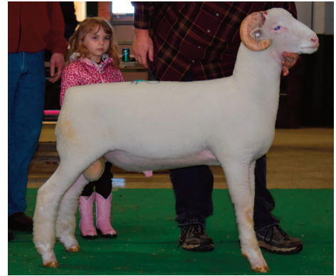
Grand & Junior Champion Horned Ram Late Fall Lamb Cassell Horned Dorsets, Wytheville, VA