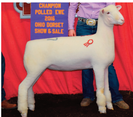
Res. Grand & Junior Champion Polled Ewe Early Fall Ewe Lamb Crome Dorsets, Marshall, IL