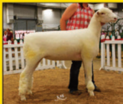
1st Late Fall Ewe Lamb • Ohio State Fair 1st Fall Ewe Lamb • Indiana State Fair