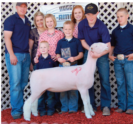
Nugget All American Sale Champion Wether Dam - Fall Lamb Fisher Club Lambs, Wilder, ID