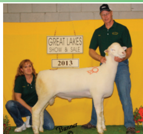
Great Lakes Sale Champion Dorset Ram - Fall Lamb Sunny Valley Farm-Reed, Manheim, PA