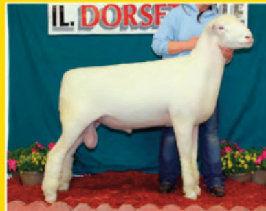
LA 11 1st Fall Yearling Ram sold to Dover Genetics, IL

ANNOUNCING... New Home of the Entire Mithoefer Dorset Flock!