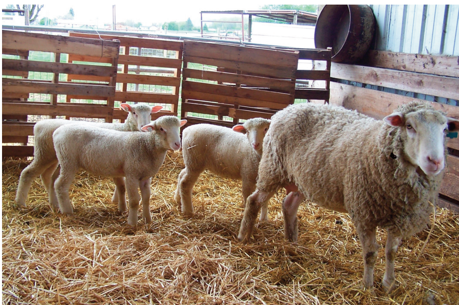
Ewe productivity is an important consideration when selecting the ideal ewe size for your sheep operation.

What this comes down to is that each individual producer will need to determine what the most efficient ewe size is for his or her operation. Pasture stocking rates, ewe productivity, feed efficiency and lamb values all play a part in determining what size ewe is most efficient for a particular operation. So, take a closer look at your farm records to sort through the pieces of the puzzle that determine what size is best for your operation.