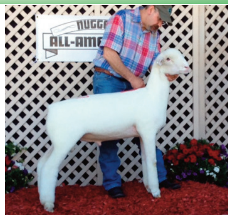
Nugget All American Sale Jr. Champ. Polled Ram - January Lamb Northern Starr Livestock, Lonsdale, MN