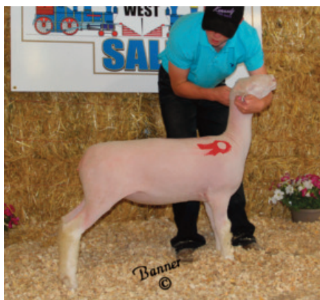
Crossroads of the West Sale Champ. Dorset Wether Dam - Spr. Lamb Fisher Club Lambs, Wilder, ID