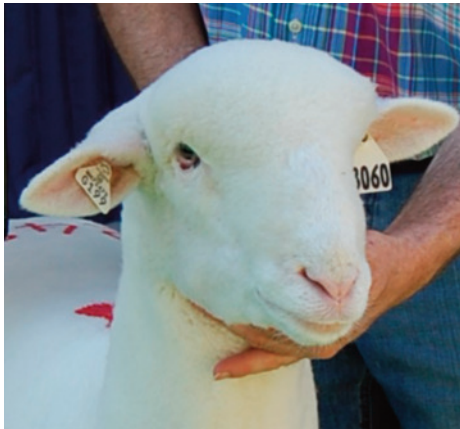
Nugget All American Sale Best Headed Polled Ram - January Northern Starr Livestock, Lonsdale, MN