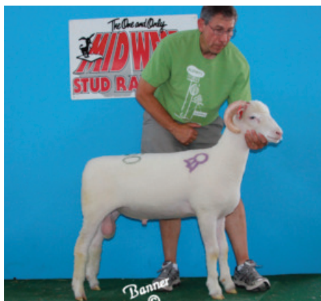
Midwest Stud Ram Sale Reserve Champion Horned Dorset Ram Galleher Farms, Mt. Gilead, OH