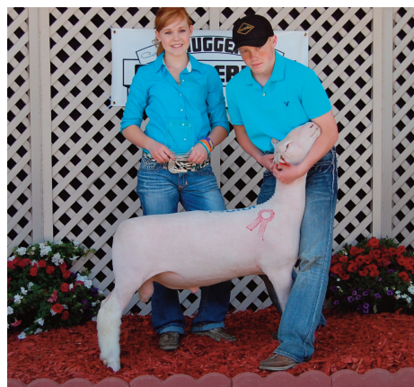
Nugget All American Sale Champion Wether Sire - February Lamb Fisher Club Lambs, Wilder, ID