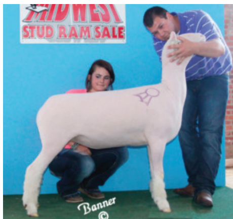
Midwest Stud Ram Sale Champ. Dorset Wether Dam - Yearling Slack Club Lambs, N. Manchester, IN