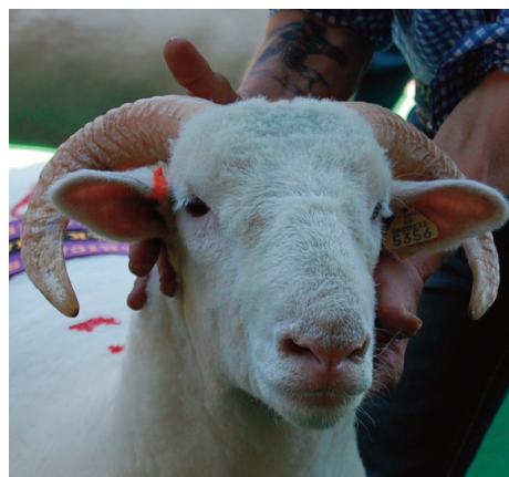
Nugget All American Sale Best Headed Horned Ewe - Fall Lamb Silvercreek Lambscapes, OR