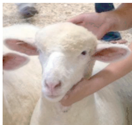
New England Regional Junior Show Best Headed Polled Ewe Ross Beed, West Hartford, CT