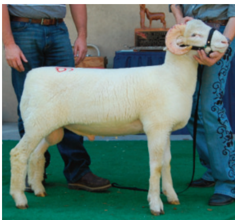
Nugget All American Sale Champion Horned Ram - Fall Lamb Silver Creek Lambscapes, OR

6 HEAD GROSSED $7,300.00 AVERAGING $1,126.66