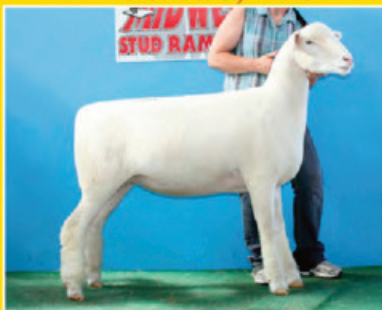
LA 762 – 3rd Yearling Ewe sold to Greenfield Farms, MO