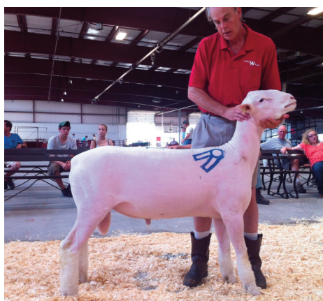
New England Sale Champion Dorset Ram - Yearling Circle W Farms, Newfoundland, PA