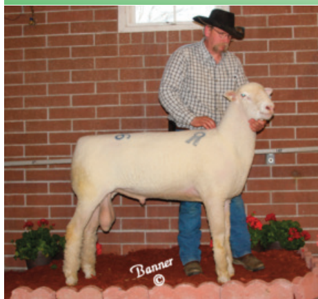
National Cornbelt Sale Champion Dorset Ram - Yearling Wolkow Dorsets, DeSmet, SD