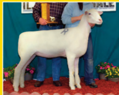
LA 763 – Grand Champion Fall Yearling Ewe sold to Aldrich Brothers, SD