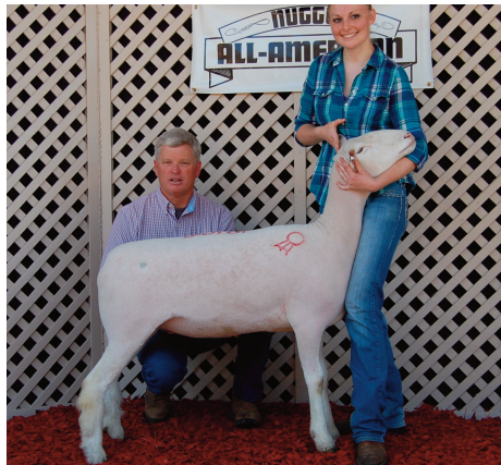
Nugget All American Sale Res. Champ. Wether Dam - Yearling Mickelson Club Lambs, Pomona, CA