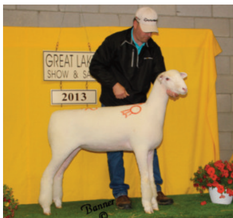
Great Lakes Sale Champion Dorset Ewe - Fall Lamb Twin Oaks Dorsets, Bell Ctr., OH