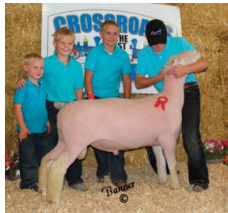
Crossroads of the West Sale Champion Dorset Wether Sire - Yearling Fisher Club Lambs, Wilder, ID