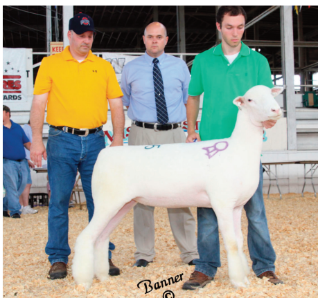
Midwest Stud Ram Sale Champion Polled Dorset Ewe Twin Oaks Dorsets, Belle Ctr., OH