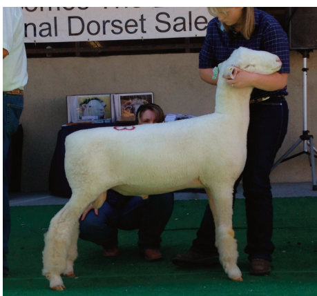
Nugget All American Sale Res. Jr. Ch. Polled Ram-January Lamb Paradigm/Beavercreek, Lincoln, CA