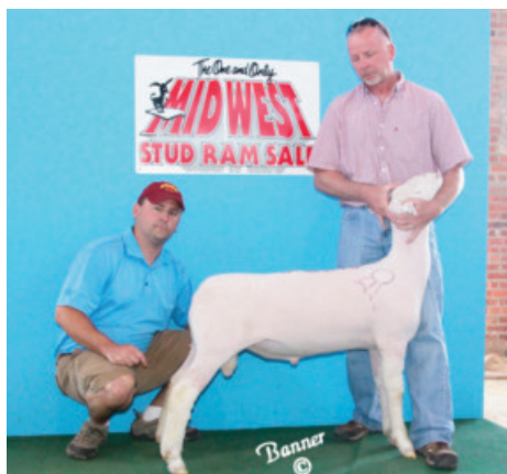
Midwest Stud Ram Sale Champion Dorset Wether Sire - January Taylor Made Club Lambs, IA