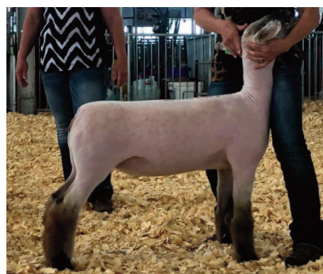
Midwest Sale Res. Jr. Champ. DA Ewe Ewe Lamb 85-92 lbs. Ott Club Lambs, Fairview, OK

28 HEAD GROSSED $26,250.00 AVERAGED $937.50