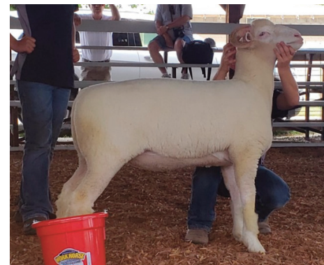
Great Lakes Reg. Res. Ch. Horned Ewe Fitted Winter Ewe Lamb ALAM Inbody Kids, Bluffton, OH