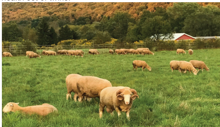
Good nutrition prior to breeding, throughout the breeding season and throughout pregnancy promotes embryonic survival.

As breeding season continues, be sure to assess body condition scores of ewes and rams. Make sure they receive adequate nutrition to support a body condition score of 3 or provide additional nutrients in the ration to improve body condition scores. The ultimate goal is for ewes to consume a ration that will promote ovulation rates to conceive twins, support embryo survival and result in a health set of twins.