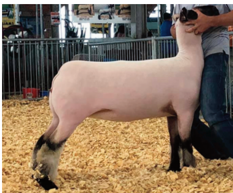
Midwest Sale Grand & Sr. Ch. DA Ewe Yearling Ewe McGolden Club Lambs, Fairview, OK