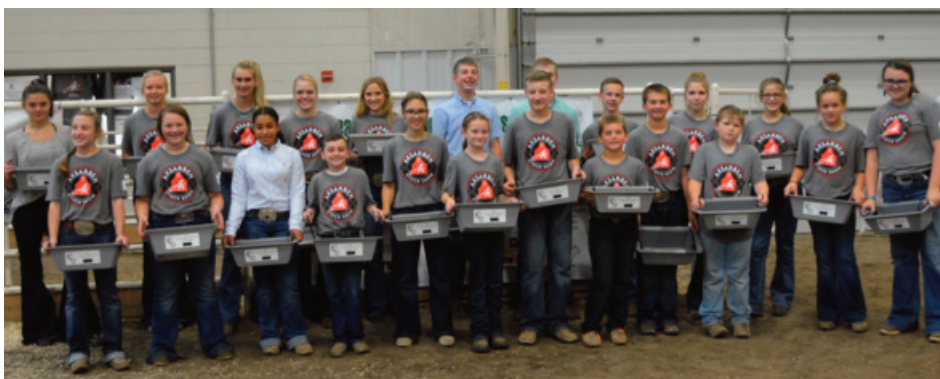
2019 Great Plains Regional Junior Dorset Show Exhibitors AKSARBEN, Grand Isle, Nebraska