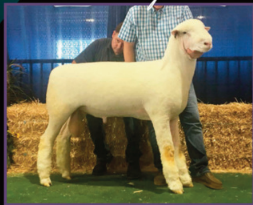
RSF 1903 / Sired by RSF 1719 SUPREME CHAMPION RAM / 2019 OR STATE FAIR 1903 is for sale! Consider putting him to work in your flock.