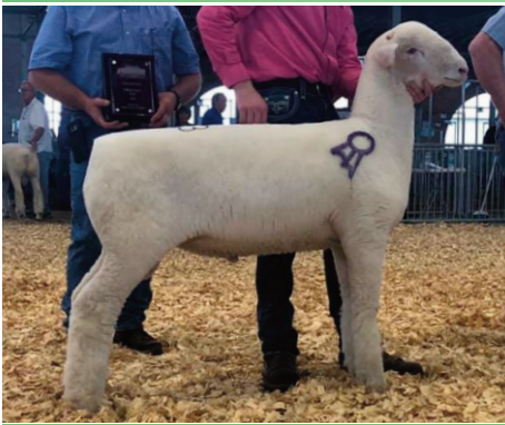
Midwest Sale Champion Polled Ram Winter Ram Lamb Cedar Lane Dorsets, Manawa, WI