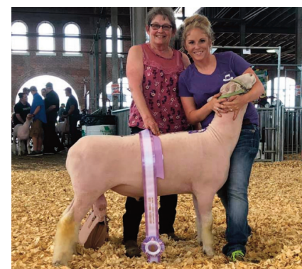
Midwest Sale Res. Sr. Champ. DA Ram Yearling Ram C & J Livestock, Polo, MO