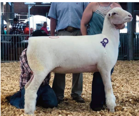
Midwest Sale Res.Champ. Polled Ewe Spring Yearling Ewe Wolkow Dorsets, DeSmet, SD

1) Champion: Galleher Farms, OH to Double A Ranch, South Shore, SD