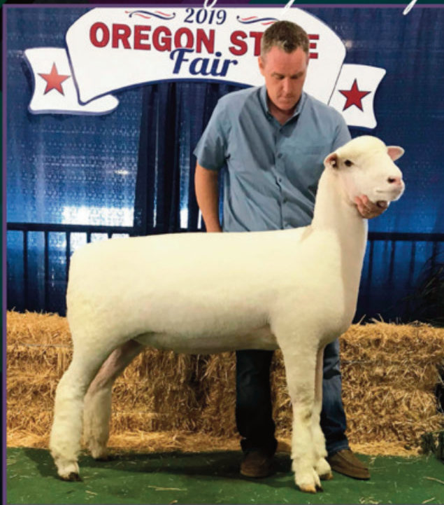
RSF 1836 Rearview/ Sired by Crome 2322 CHAMPION EWE / 2019 OR STATE FAIR

The intersection of strategic matings and sound management.