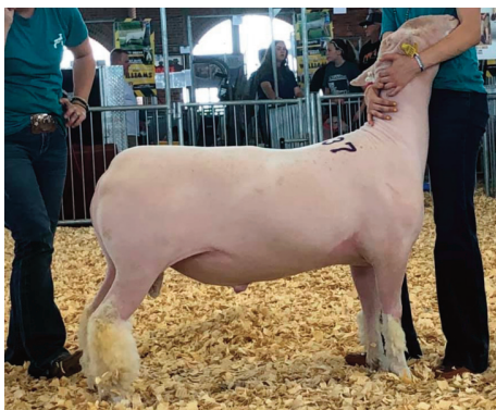
Midwest Sale Sr. Champ. Wether Sire Yearling Ram Turner Show Stock, Van Alstyne, TX

5) Harms Show Lambs, IL to Stillwell Club Lambs, Frankfort, IN $800