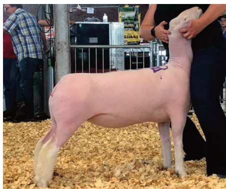
Midwest Sale Res. Sr. Ch. Wether Dam 2nd Yearling Ewe Enfield Club Lambs, Collins, IA