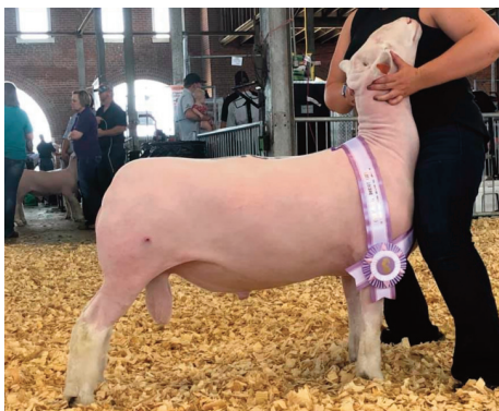
Midwest Sale Res. Sr. Ch. Wether Sire 2nd Yearling Ram Enfield Club Lambs, Collins, IA