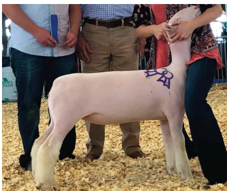
Midwest Sale Res. Grand & Jr. Ch. Wether Dam - Ewe Lamb 102-114 lbs. Fisher Club Lambs, Wilder, ID