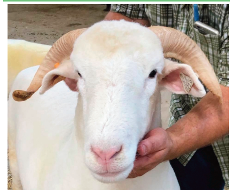
New England Best Headed Horned Ewe Yearling Ewe Emma Oberholtzer, East Earl, PA