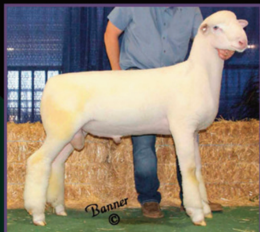
RSF 1926 / Sired by RSF 1801 Benchmark 1ST SPRING RAM LAMB/ 2019 OR STATE FAIR