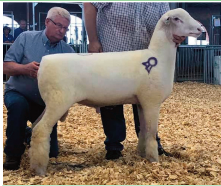
Midwest Sale Res.Champ. Polled Ram Late Fall Ram Lamb Penn View Dorsets, Blairsville, PA