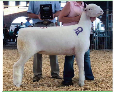
Midwest Sale Champion Polled Ewe Fall Yearling Ewe Turtle Mead Dorsets, Sinking Spgs., PA