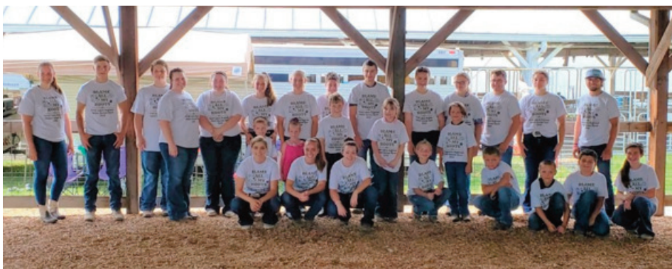
2019 Great Lakes Regional Junior Dorset Show Exhibitors Miami County Fairgrounds, Troy, OH