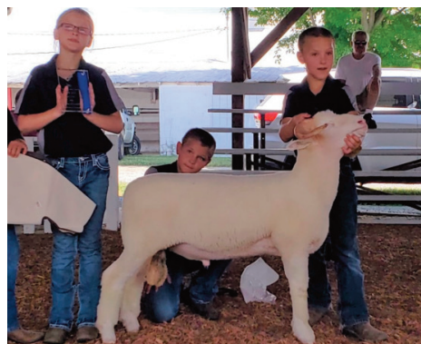
Great Lakes Reg. Champ. Horned Ram Fitted Winter/Spring Ram Lamb ALAM Inbody Kids, Bluffton, OH