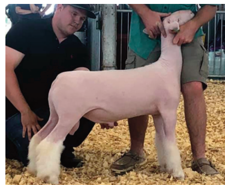
Midwest Sale Res. Gr. & Res. Jr. Ch. Wether Sire - Ram Lamb 71-94 lbs. S & S Dorsets, Shelby, OH

1) Res. Champion: Silver Creek Lambscapes, OR to Ernst Farms, Lacona, IA $300